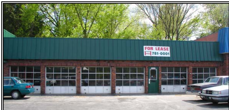
Additional 1,800± SQ. FT. Available Only If Combined With The 3,692± Sq. Ft.