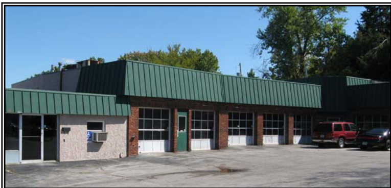
3,692± SQ. FT.